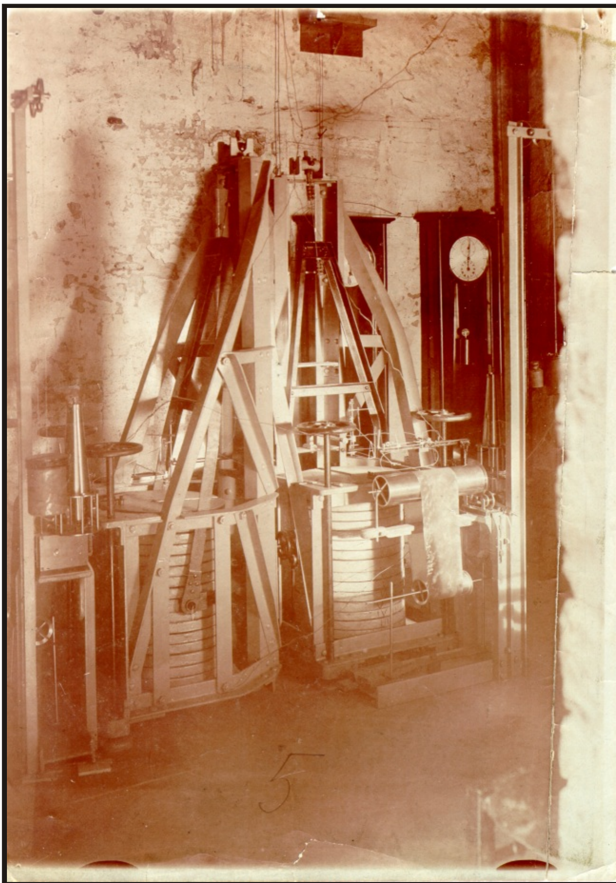
The Mainka Seismographs at Parkhill Observatory, Dyce, Aberdeen.